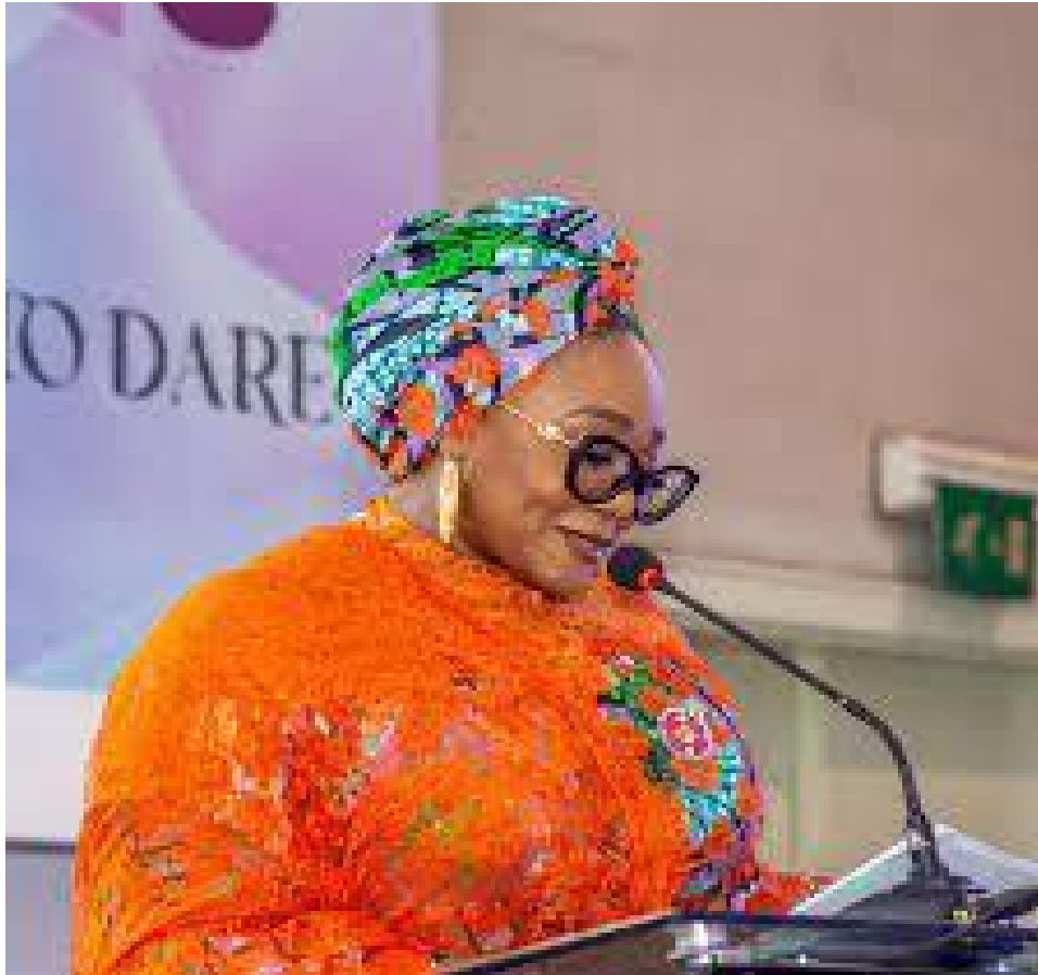
Hajia Imaan Sulaiman-Ibrahim, Minister of Women Affairs

The Honourable Minister reaffirmed the Federal Government's unwavering commitment to mainstreaming women's empowerment into every layer of national policy. She emphasised that the Young Women in Agriculture initiative is not an isolated project but a pillar of the Renewed Hope Agenda of President Bola Ahmed Tinubu, designed to place women at the centre of Nigeria's economic transformation.