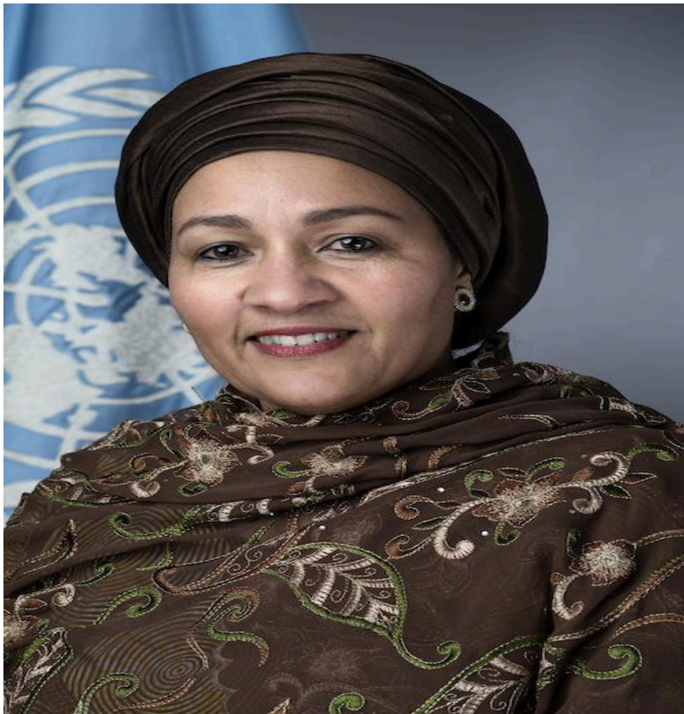
UNITED NATIONS DEPUTY SECRETARY-GENERAL AMINA J. MOHAMMED

Introduction: A Defining Moment for Nigeria and the World On 4 March 2025 , the Maryam Babangida National Centre for Women Development in Abuja became the epicentre of a historic convergence of global leadership, national resolve, and grassroots mobilisation. The occasion was the National Flag-Off of the UNESCO REF 12 million Mobilisation Campaign , commemorating the United Nations International Women's Day 2025 .