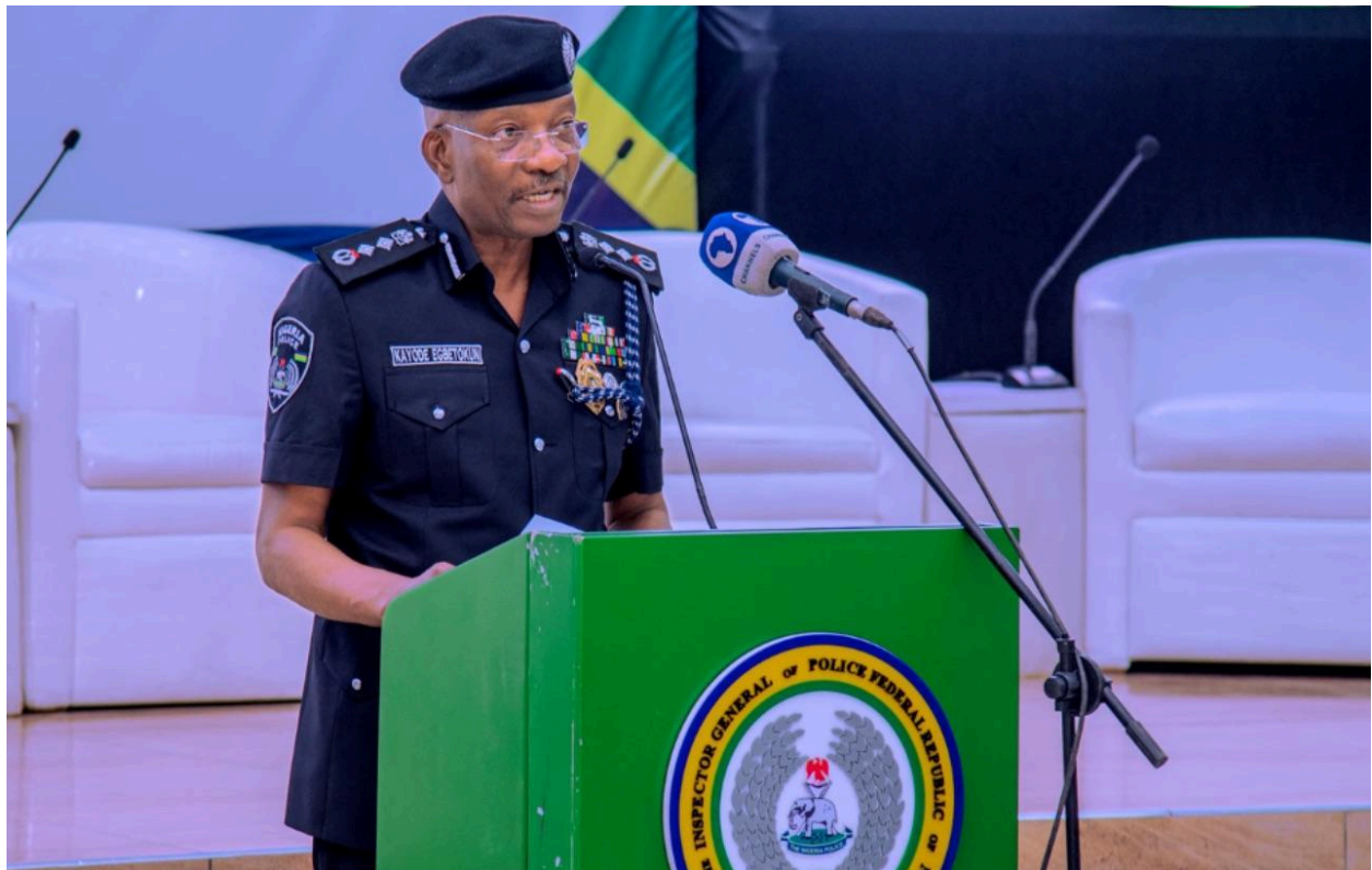
Dr. Kayode Adeolu Egbetokun, Inspector-General of Police

She concluded by pledging the Ministry's continued support in policy alignment, advocacy, and resource mobilisation to ensure that the mobilisation of 12 million women becomes a lasting legacy for Nigeria and a model for Africa.